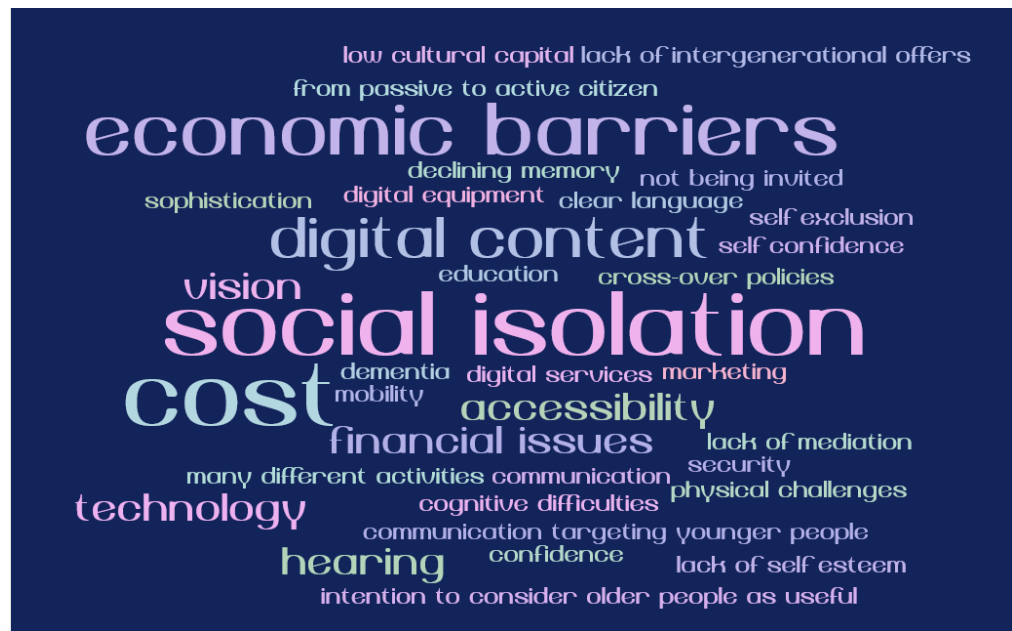
2: Word cloud: "Which barriers hinder the cultural participation of older people?" (F6)

The three most frequently named barriers are social isolation, economic barriers (including costs), and digital content but there are many others that need to be considered in order to improve older people's cultural participation.