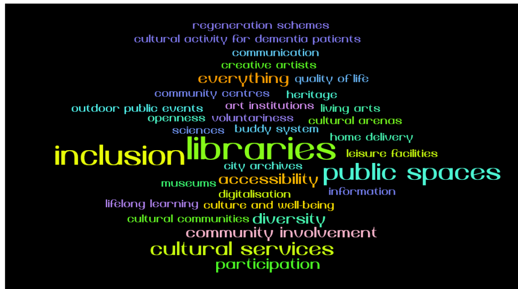
4: Word cloud F28 ("Which thematic areas are addressed in these strategic documents aimed at older people (e.g. libraries, culture in public space, inclusion)?")

In another open question, respondents were asked about the most common topics of planning documents. The most frequently named topics include libraries, inclusion, and public spaces.