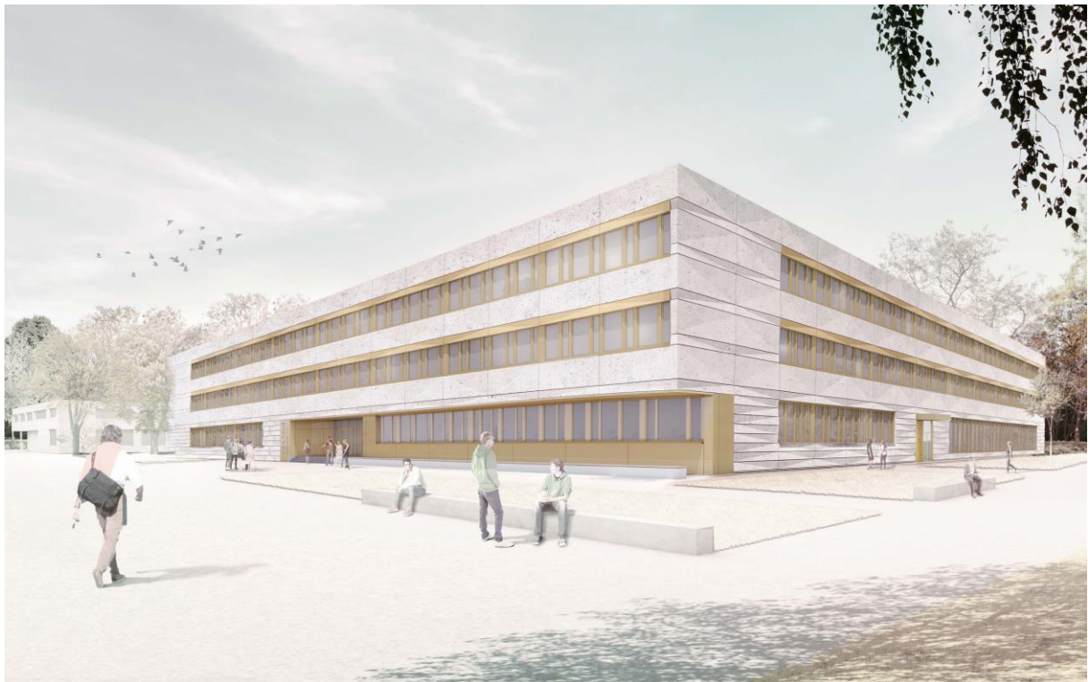
New OSZ Sozialwesen Anna-Freud-Schule, exterior perspective © NAK Architekten

The state of Berlin, represented by the Senate Department for Culture and Social Cohesion, is announcing an open two-phase art-in-architecture competition for professional visual artists and groups of artists for the new building of the Anna Freud School (Oberstufenzentrum für Sozialwesen). A budget of up to 302,500.00 euros incl. VAT is available for the realisation of the artwork including all costs for fees, material and production costs including all ancillary costs.