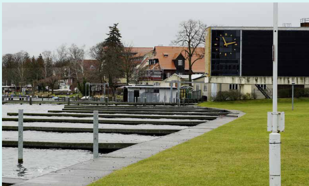
Sportmuseum Berlin; Wassersportmuseum Grünau