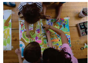
Image: Valentina Sartori Art project: Sturm und Strand (Storm and Beach)

This fund provides resources for projects where children, youth and young adults up to the age of 27 actively participate. Eligibility applies exclusively to cooperation projects of cultural institutions/independent artists (= cultural partners) together with Pankow day-care centres/schools/recreational facilities etc. (educational partners), e.g. a project week at the school, an art project in the day-care centre, a workshop in a recreational facility for youth.