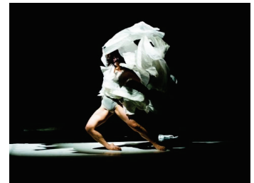
ELEKTRO KAGURA | G8.000.000

Funding is provided for current individual projects that are presented to the public in Pankow. They should contribute to the diversity and vitality of cultural life in the district, e.g. an exhibition, a reading, a concert, a performance, a theatre production. Interdisciplinary projects will also be considered, however, projects from the field of cultural education will not.